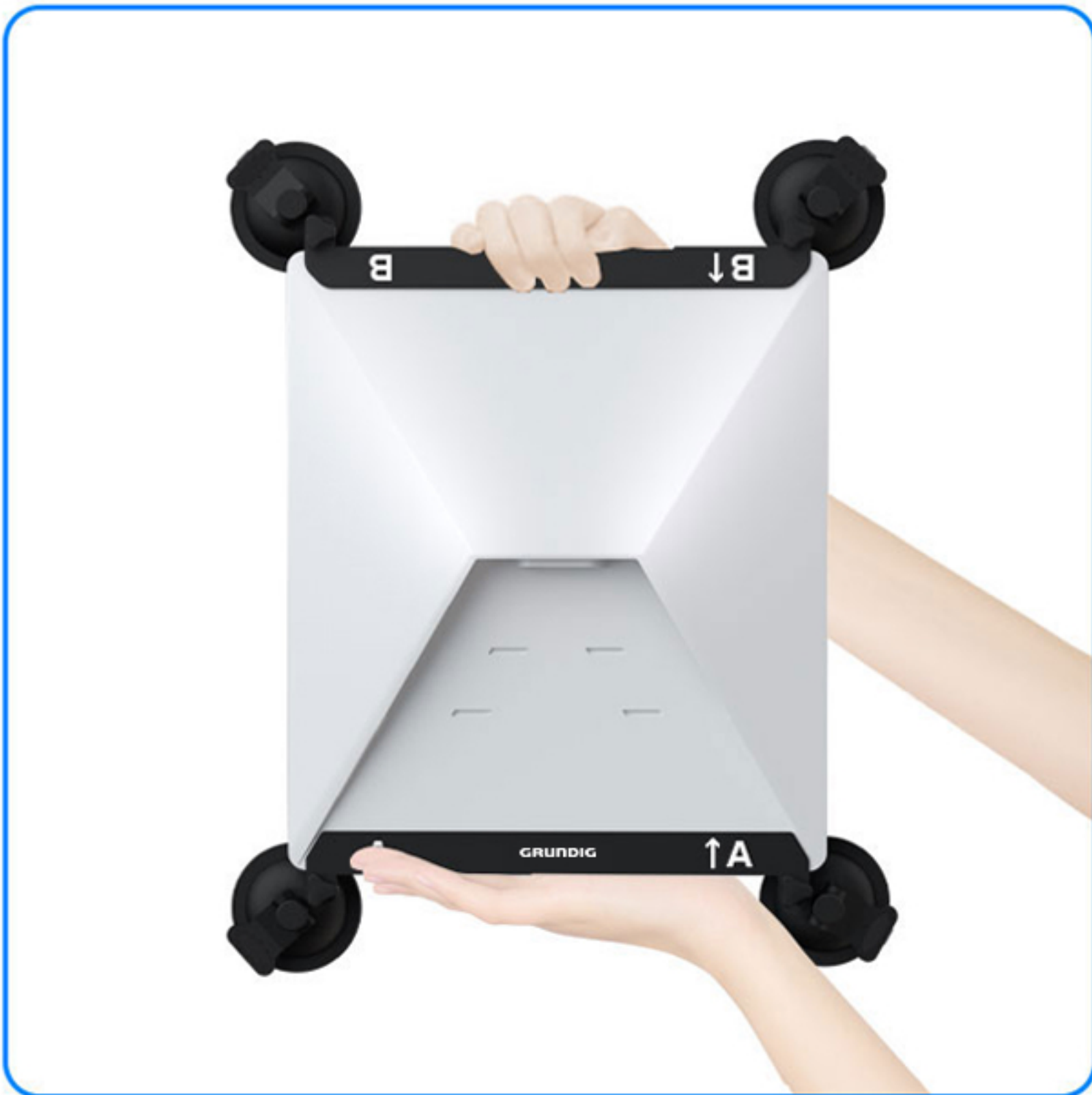
Install four brackets