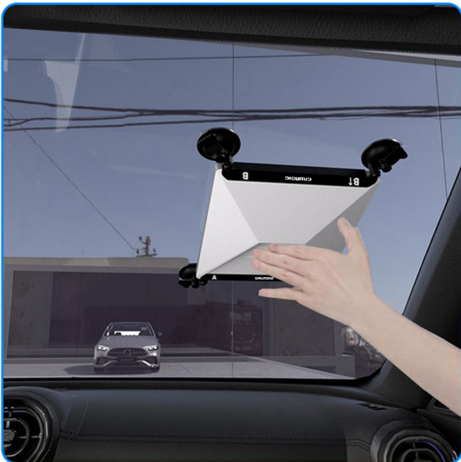
Adhere to the glass