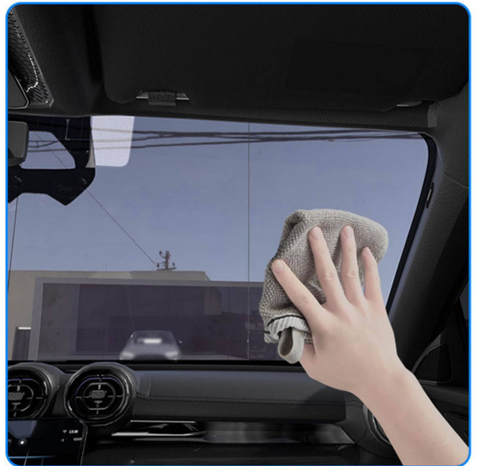
Clean the glass